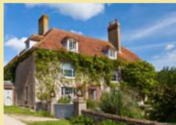
The walks, visits and annual events are fundraising events in aid of the Charleston Trust (Bloomsbury in Sussex). Duncan Grant studio pic (above right)