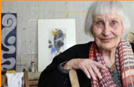
Angelica

Born at Charleston on Christmas day 1918, Angelica was actively involved in the interior decoration of the house and she played a central role in its restoration in the 1980s. We are delighted to be exhibiting some of her most recent work here in the Charleston Gallery. All works will be for sale and the proceeds will go to support the Charleston Centenary Project.