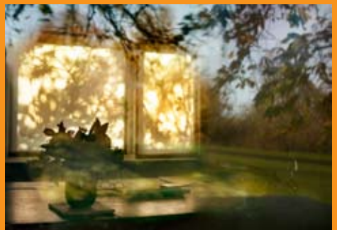
© Annie Leibovitz. From "Pilgrimage" (Random House, 2011)